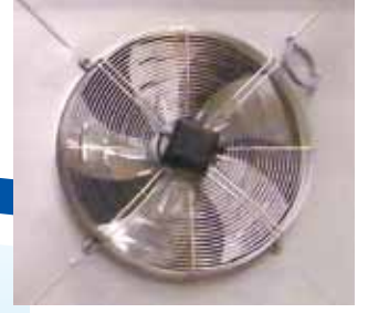
Stainless Steel Fan Blade and Guard