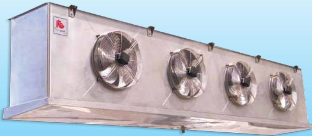
Stainless Steel Casing and Fan Blade